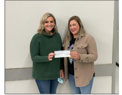
We are pleased to present a $500 cheque on behalf of our club towards the vaccine fridge

4. Senior Girls Volleyball Provincials: We would like to welcome all of the teams to Macklin and wishes everyone a safe and fun weekend! We are also proud sponsors of the event this year