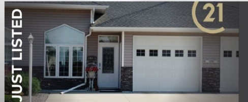
JUST LISTED 5364 Progress Street 3 Macklin, SK S0L2C0 Nicole Lovell CENTURY 21 Canada